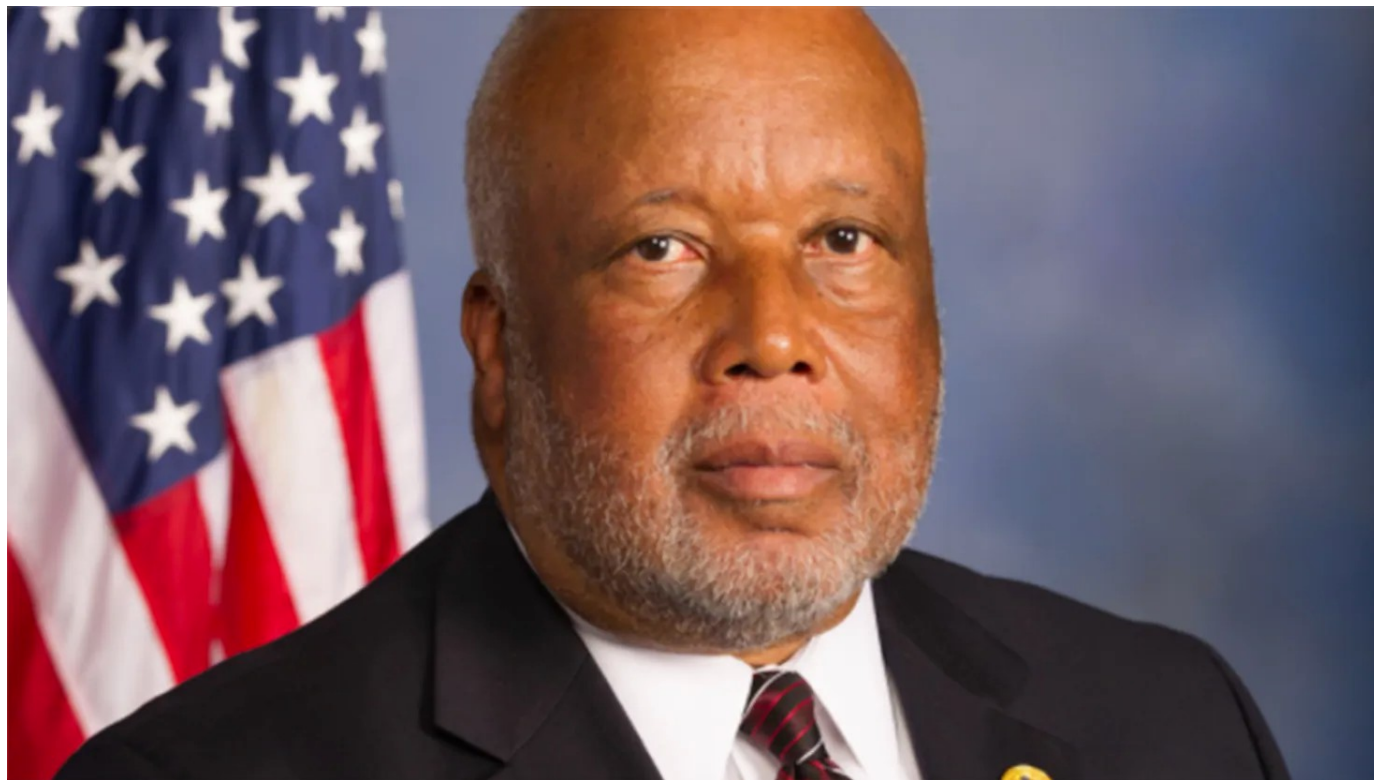
Rep. Bennie Thompson, D-Miss., filed the lawsuit Tuesday.

"While the majority of Republicans in the Senate abdicated their responsibility to hold the President accountable, we must hold him accountable for the insurrection that he so blatantly planned. Failure to do so will only invite this type of authoritarianism for the anti-democratic forces on the far right that are so intent on destroying our country."