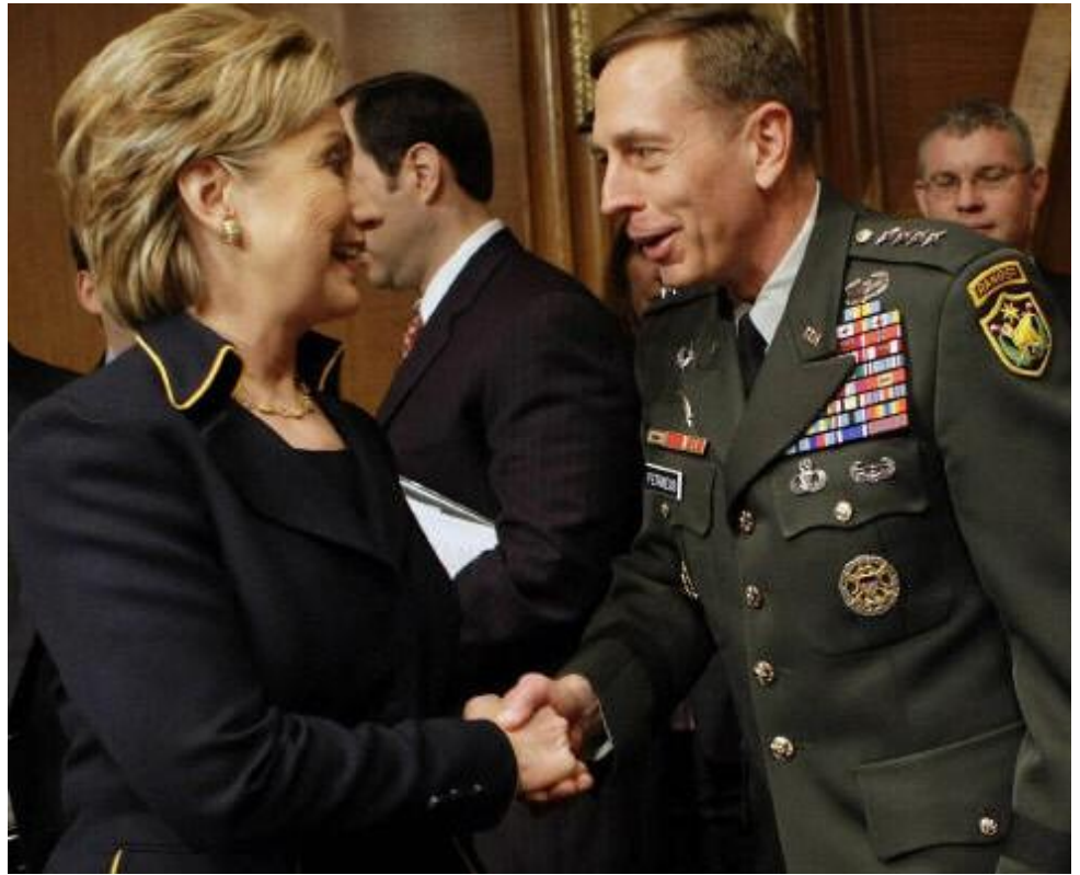
Crooked Hillary (the witch) Clinton and traitor General Petraeus.