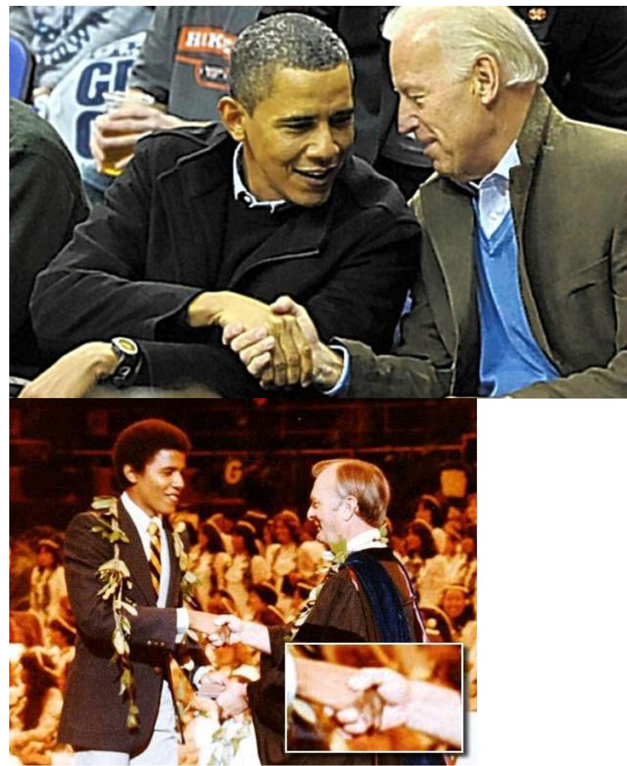
Sissy boy Barack HUSSEIN Obama.