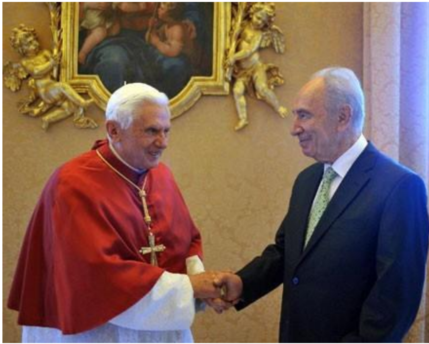
Ratzinger and another Israeli traitor Prime Minister Peres, Shimon.