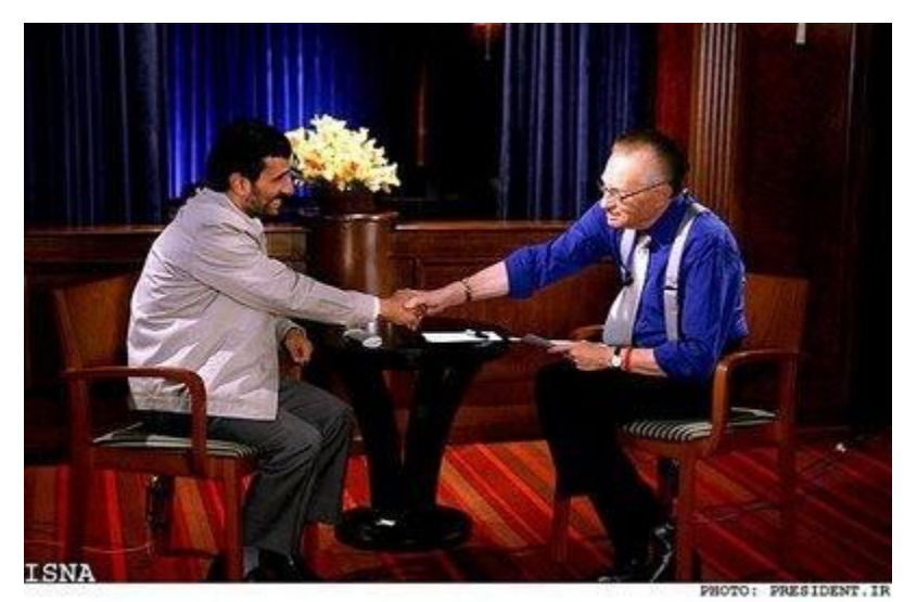
Ahmadinejad with Larry King