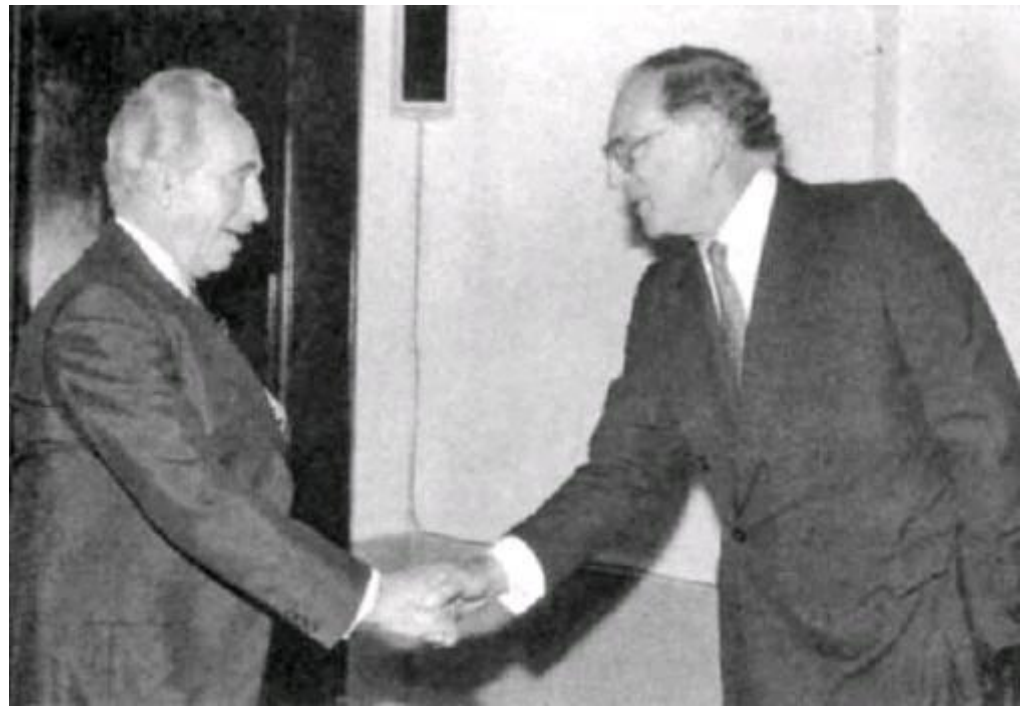
Shimon Peres, former Prime Minister and leader of Israel's Labor Party (left), in Masonic grip with Morton L. Janklow of the Council on Foreign Relations (CFR).